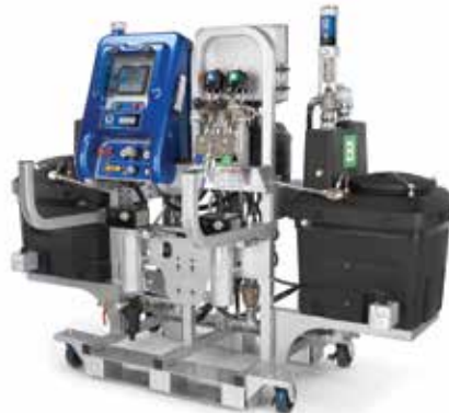
Variable Ratio Electronic Pneumatic for coatings.