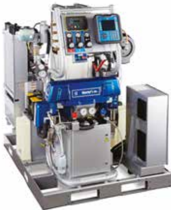
Complete Turnkey Integrated All in One Solution. Small and efficient 22kw gendset means significant fuel savings over traditional set-up. Lightweight means possible smaller truck or tow vehicle resulting in further fuel savings.