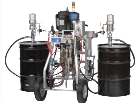
Fixed Ratio Pneumatic for coatings.