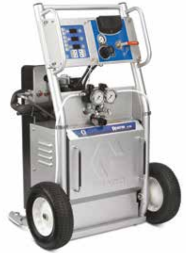
Entry Level Pneumatic and Electric.