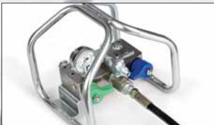
Remote Mix Manifold

Material mixing reaches a new level of precision due to new dosing technology. With the Graco XM, the minor component (or side B material) is injected at high pressure into the major material (side A). Advanced sensors allow pumps to compensate for pressure fluctuations, resulting in accurate, on-ratio mixing for better yield and less waste.