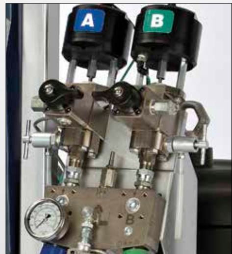
Standard Mix Manifold

Choose standard, frame-mounted mix manifold or remote mix manifold; both include a pressure gauge that displays fluid output pressure.